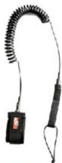
LSH0030 - Calf