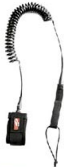
LSH0029 - Ankle