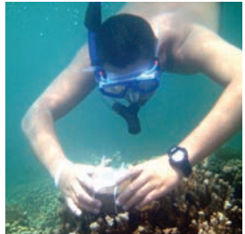
Students present their findings in a final presentation forum and must complete 10 hours of community service to obtain their college credit and qualify for internships.