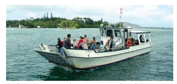
Students have special access to Windward Community College laboratories and HIMB facilities on and around Coconut Island. Students work in teams to conduct real scientific surveys and testing concentrating on marine biology, including reef and ocean health.